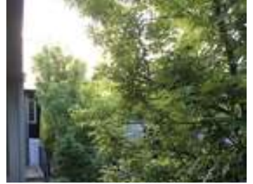
Bohemia #208 670 W. 6th Ave., Vancouver, BC, V5Z 1A3 2 Bedroom + Balcony - 887 sq.ft.